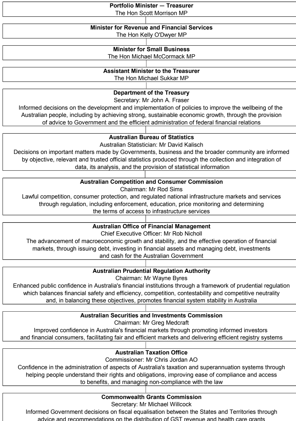
Figure 1: Treasury portfolio structure and outcomes