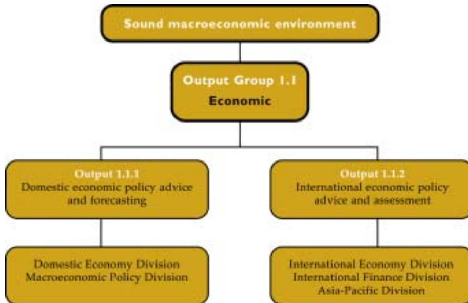
Chart 5: Outputs contributing to Outcome I