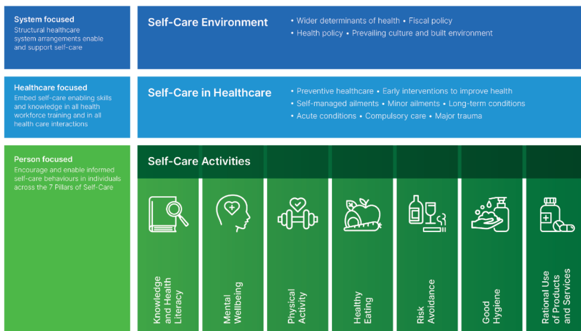
Figure 1 – The Self-Care Matrix

The self-care matrix ( Figure 1 ) shows the everyday actions that people can take to enhance their mental and physical health and wellbeing, prevent disease, limit illness, and use healthcare services effectively. These seven self-care domains can assist policymakers and healthcare professionals to engage Australians in the proactive management of their health. However, the Self-Care Matrix also illustrates how self-care cannot be reduced to individual responsibility and should be supported by the health system and broader public health levers.