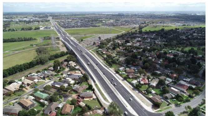
Image shows part of the recent upgrade to Thompsons Road from Dandenong-Frankston Road to Berwick-Cranbourne Road by the Victorian Government. This provides a blueprint for the Thompsons Road upgrade and extension through to Pakenham.

It will unlock a growing regional employment precinct to accommodate 100,000 local jobs, as well as create approximately 500 jobs during construction.