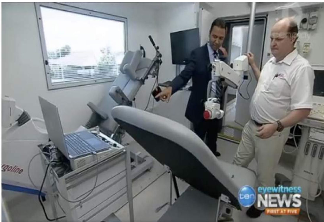
STATE-OF-THE-ART: Inside Heart of Australia's B-Double mobile clinic HEART2.