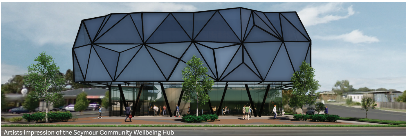
Artists impression of the Seymour Community Wellbeing Hub

Investment in Mitchell Shire now would be truly transformational. CONNECTING MITCHELL represents the opportunity to create a healthy, connected and sustainable community.