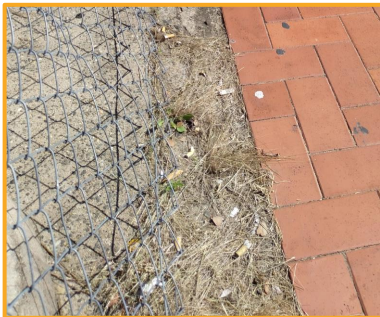
Cigarette butt litter remains the most reported litter item

Whilst cigarette butt filters are the primary focus of the product stewardship, consideration needs to be given for the emerging trend of vaping and the implications to the environment of vaping devices.